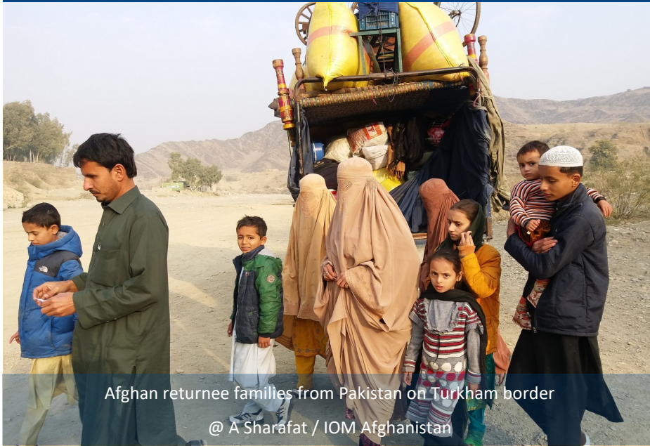
Afghan returnee families from Pakistan on Turkham border