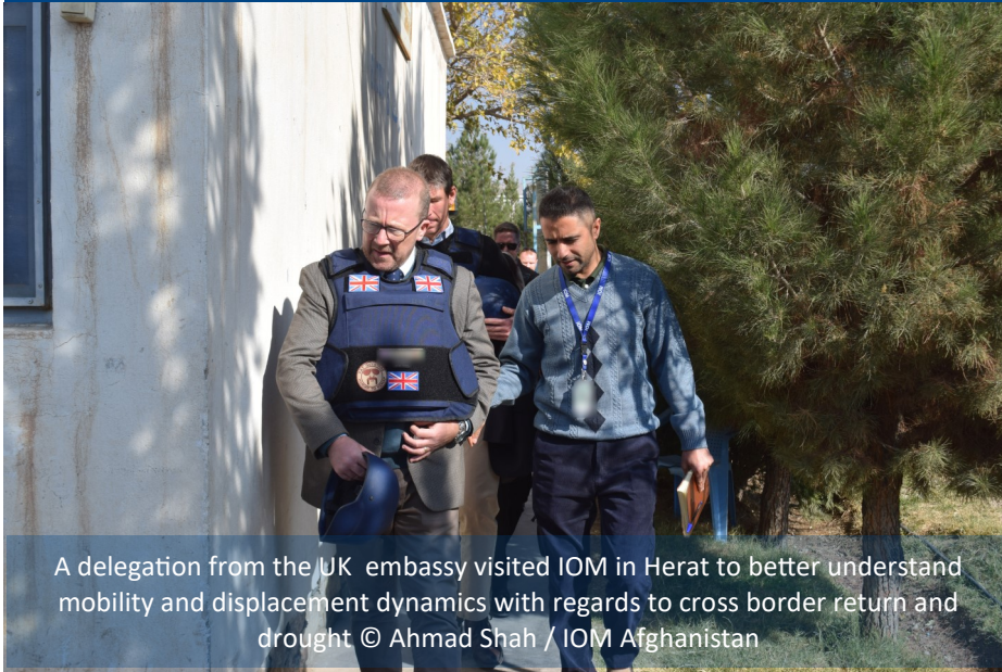
A delegation from the UK embassy visited IOM in Herat to better understand mobility and displacement dynamics with regards to cross border return and drought