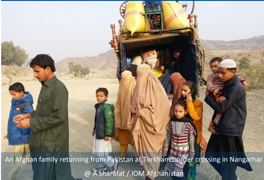
An Afghan family returning from Pakistan at Torkham border crossing in Nangarhar