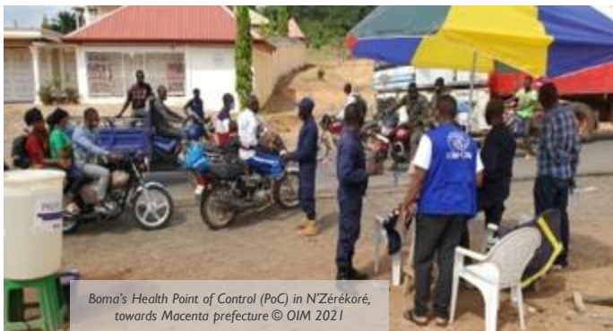
Boma's Health Point of Control (PoC) in N'Zérékoré, towards Macenta prefecture

Since February 2021, Guinea has been facing the resurgence of the Ebola epidemic. For the first time since 2016, cases of haemorrhagic fever caused by the virus have been recorded in the prefecture of N'Zérékoré, located in the south-east of the country, leading to several deaths. The first victim, identified in the sub-prefecture of Gouécké, was a nurse who died at the end of January 2021. All the other cases are people who attended the funeral on February 1, 2021. On 14 February, the Guinean Ministry of Health (MoH) officially declared an outbreak of EVD.