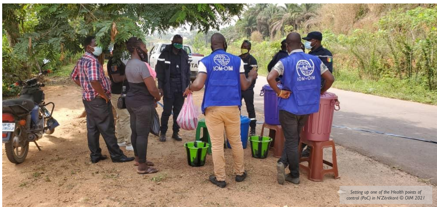
Setting up one of the Health points of control (PoC) in N'Zérékoré

N'Zérékoré on 3 March 2021: installation of 4 Health Control Points (PoC) at the main exits of the urban municipality. To help break the chain of transmission of the EVD outbreak in the health district of N'Zérékoré, IOM has supported the installation of 4 health PoC at the main exits of the urban municipality. Health control agents (Civil protection agents, Community health workers and Healthcare agent) were deployed at each PoC and are responsible for systematically taking the temperature of all passengers, guiding them to wash their hands, raising their awareness on preventive measures against EVD and recording data of passengers leaving the urban municipality for possible follow-up.