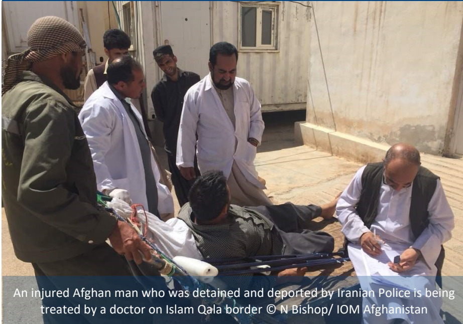
An injured Afghan man who was detained and deported by Iranian Police is being treated by a doctor on Islam Qala border