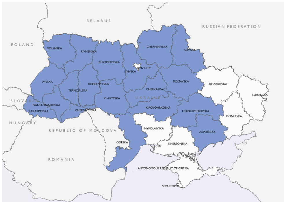
Map 1. DTM Round 8 Oblast level coverage in Kyivska, Dnipropetrovska, Poltav'ska, Vinnytska, Zakarpatska, Cherkaska, Lvivska, Khmelnytska, Ivano-Frankiv'ska, Ternopil'ska, Odeska, Kirovohradska, Chernivetska, Zhytomyrska, Chernihiv'ska, Zaporizka, Volynska, Rivnenska and Sum'ska oblasts.

For more insights on displacement trends in Ukraine see IOM Ukraine's general population survey which provides national and macro-region level estimates and insights on human mobility and needs using phone surveys and a randomized sampling approach. This area baseline report complements the general population survey by highlighting the distribution of internally displaced population within oblasts at the hromada level.