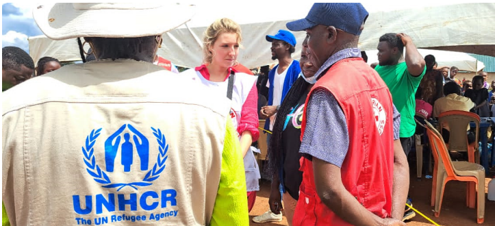
Sensitization activity @IOM-DTM/2023