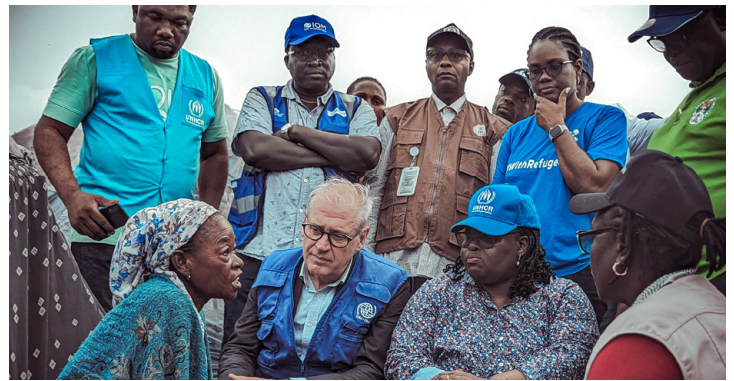
During the field visit of IOM's Chief of mission and the CD UNHCR @IOM-DTM/2023