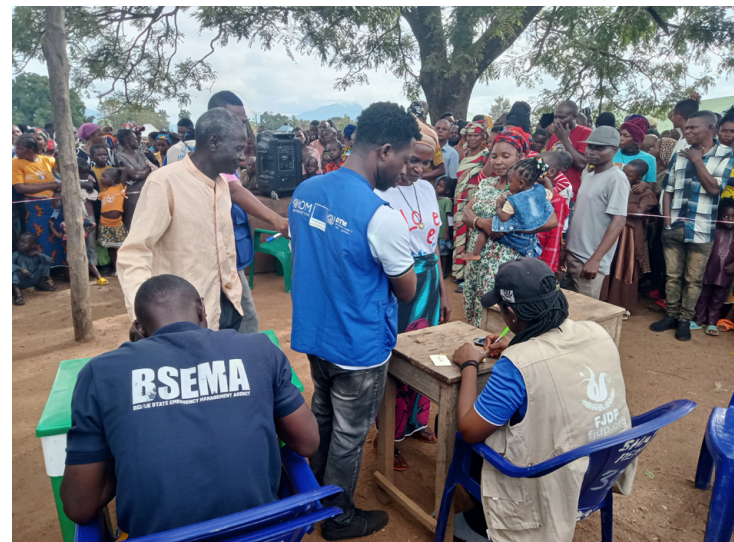
Token verification @IOM-DTM/2023

For more information or to report an alert, please contact: DTM Nigeria: iomnigeriadtm@iom.int | dtm.iom.int/nigeria More products are available on https://dtm.iom.int/nigeria