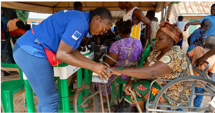
Biometric registration of a vulnerable person