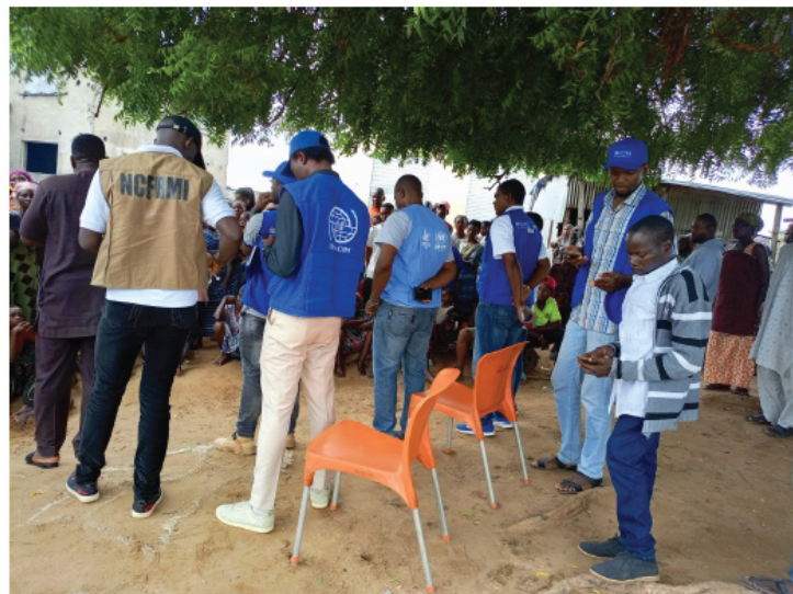
Sensitization activity in Ichwa Camp