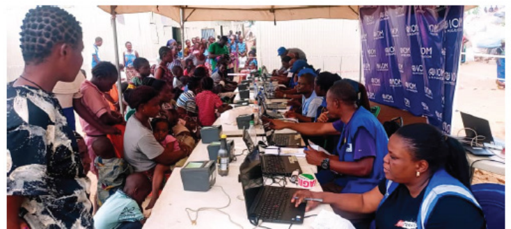
Biometric registration in Ichwa Camp