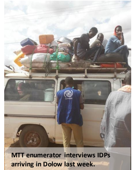
MTT enumerator interviews IDPs arriving in Dolow last week.