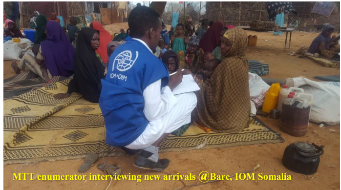
MTT enumerator interviewing new arrivals @Bare, IOM Somalia