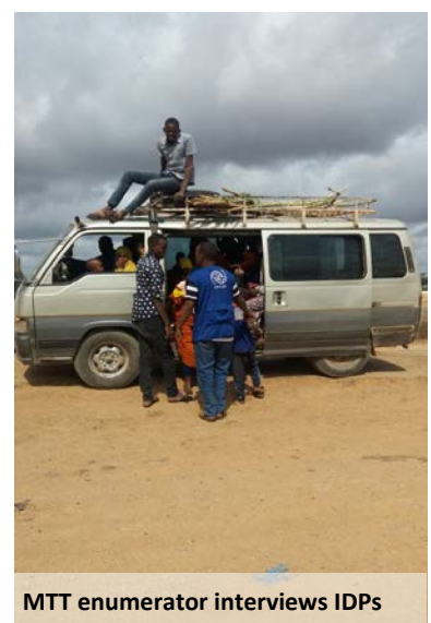
MTT enumerator interviews IDPs arriving in Baidoa last week.

• 31% of those leaving reported their reason for exit is to rejoin the rest of the families, manage their farms (28%), seeking education opportunities (22%) and seeking better services (19%). Those exiting were from the IDPs sites of Dolow2 (28%), Buur Edoy (22%), Hassan Muumin (22%) Rojo (19%), Sedex Buurow (9%). 42% of the exits reported to be going to Dadaab, Kenya, 31% going back to Xudur district and 28% of the exits were returning to Baidoa district. 58% of the families said they intend to return to the IDP sites in the future.