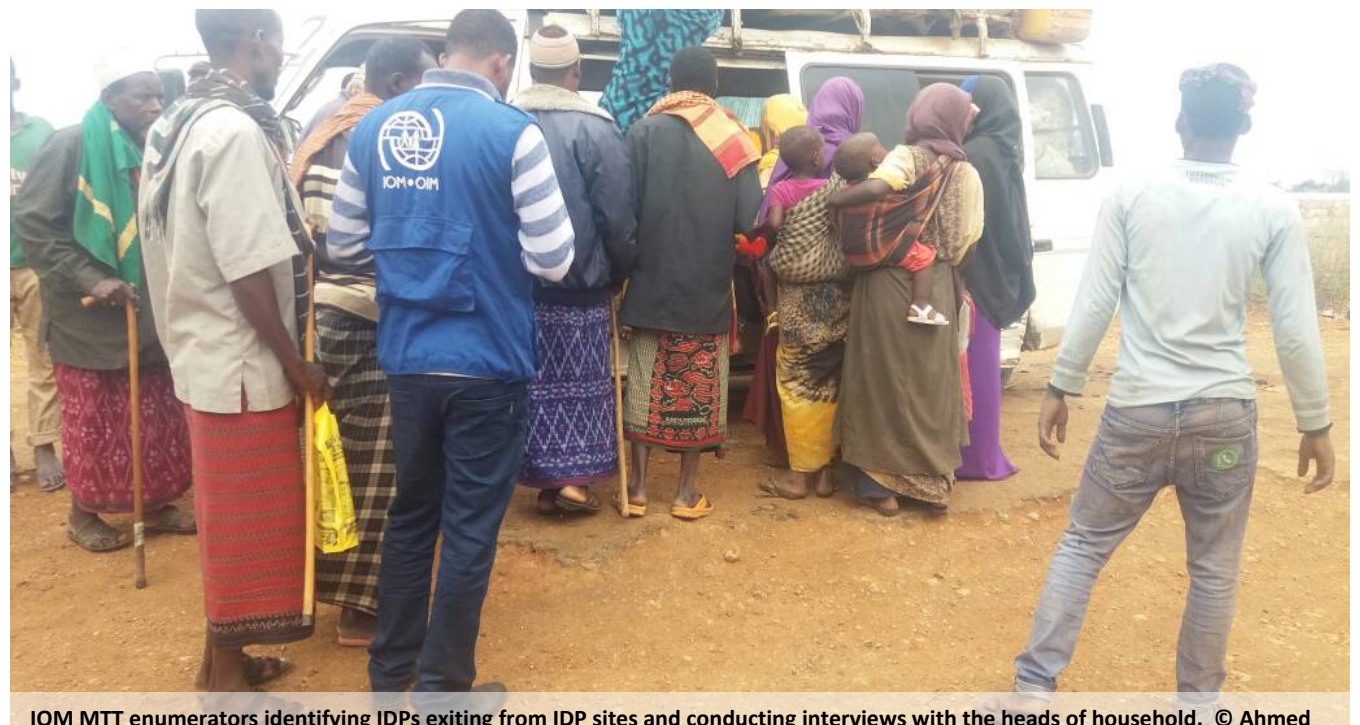
IOM MTT enumerators identifying IDPs exiting from IDP sites and conducting interviews with the heads of household.

MTT aims to complement existing information management products on displacements and movements in Baidoa, by providing site level specific data on population movements on a regular basis, to assist agencies operating in sites and settlements with key information on: demographics of movement, area of origin, area of return/onward movement, reasons for movement and movement trends over time.