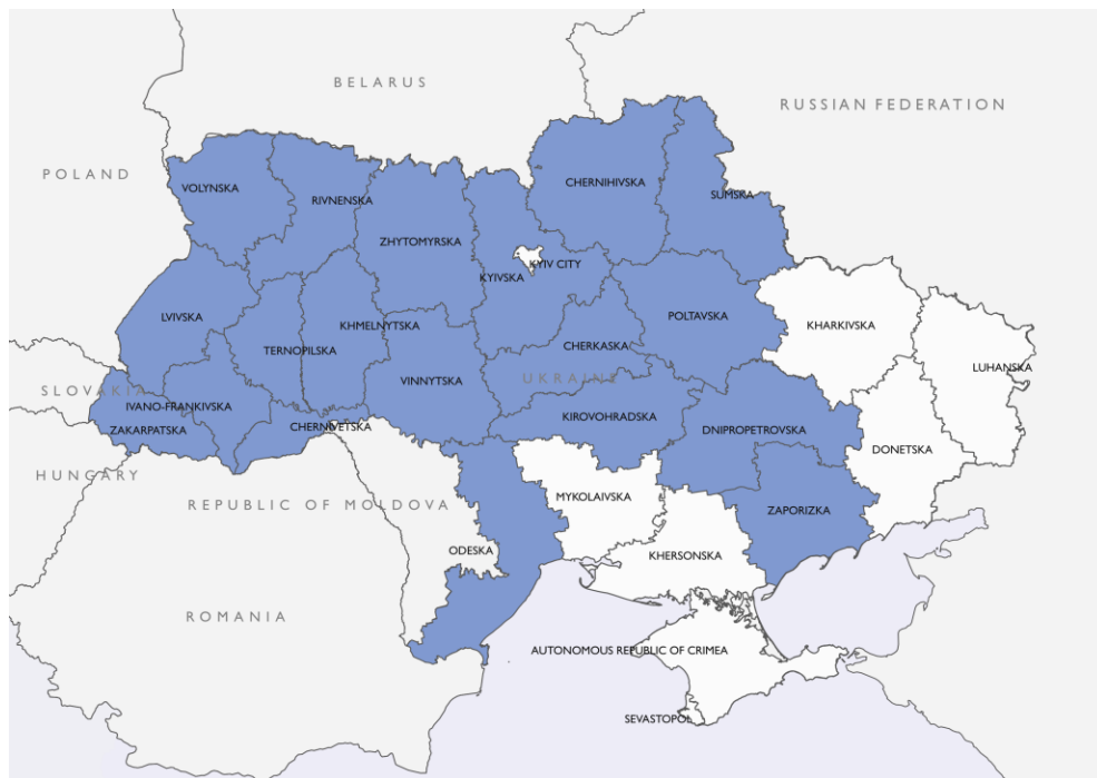
Map 1. DTM Round 8 Oblast level coverage in Kyivska, Dnipropetrovska, Poltav'ska, Vinnytska, Zakarpatska, Cherkaska, Lvivska, Khmelnytska, Ivano-Frankiv'ska, Ternopil'ska, Odeska, Kirovohradska, Chernivetska, Zhytomyrska, Chernihiv'ska, Zaporizka, Volynska, Rivnenska and Sum'ska oblasts.

For more insights on displacement trends in Ukraine see IOM Ukraine's general population survey which provides national and macro-region level estimates and insights on human mobility and needs using phone surveys and a randomized sampling approach. This area baseline report complements the general population survey by highlighting the distribution of internally displaced population within oblasts at the hromada level.