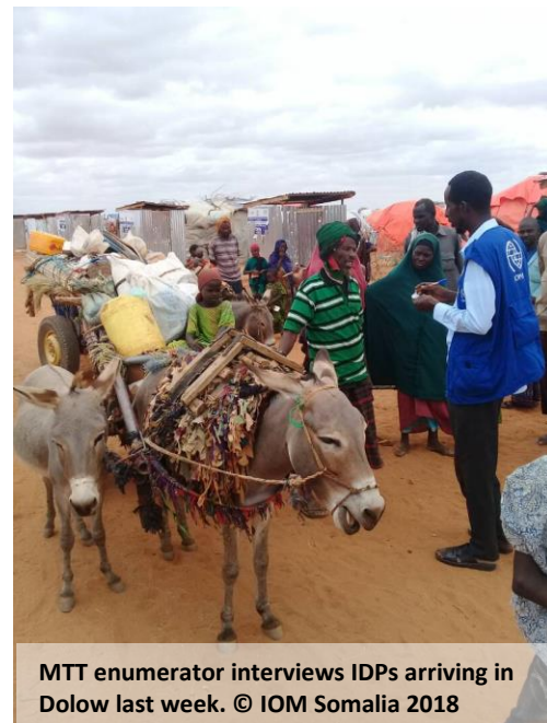
MTT enumerator interviews IDPs arriving in Dolow last week.