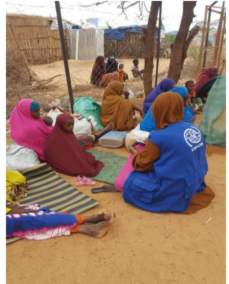
Figure 1: MTT enumerator interviewing new arrival