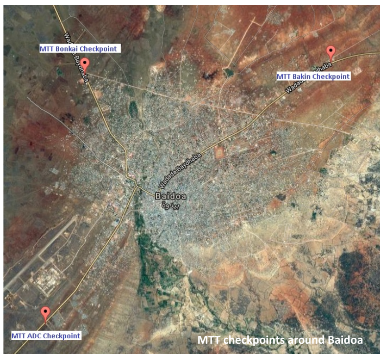
MTT checkpoints around Baidoa

MTT aims to complement existing information management products on displacements and movements in Baidoa, by providing site level specific data on population movements on a regular basis, to assist agencies operating in sites and settlements with key information on: demographics of movement, area of origin, area of return/onward movement, reasons for movement and movement trends over time.