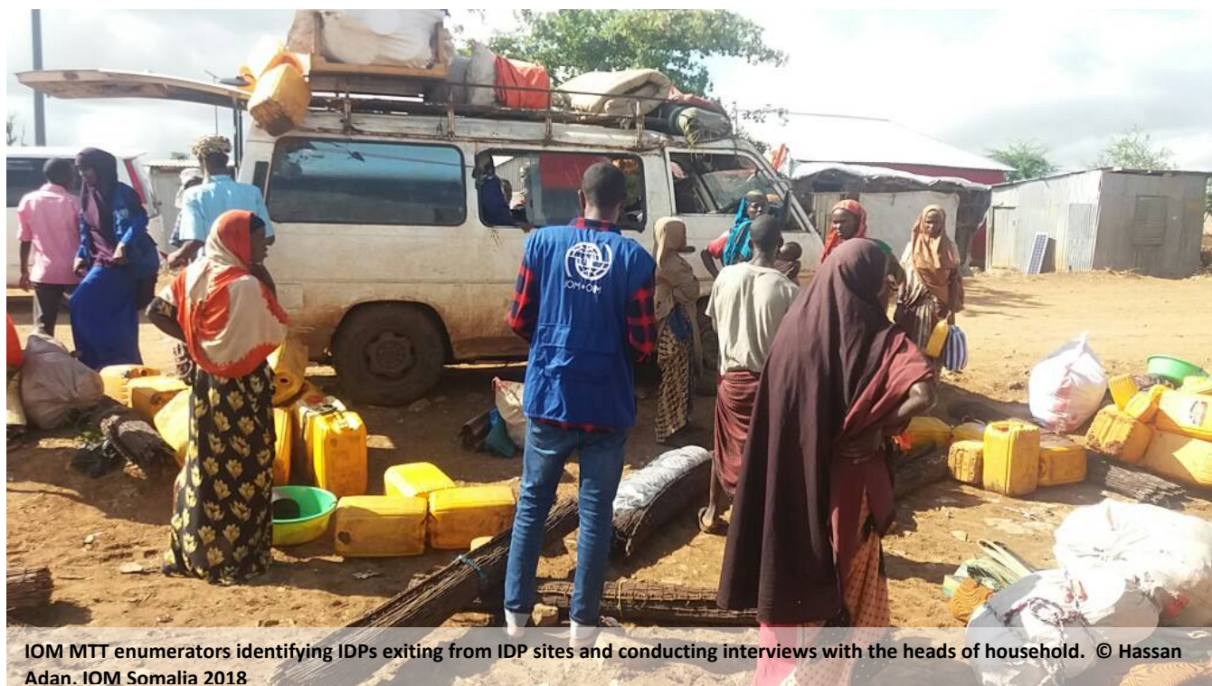
IOM MTT enumerators identifying IDPs exiting from IDP sites and conducting interviews with the heads of household.