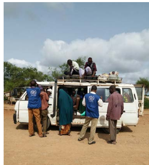
MTT enumerators interview IDPs arriving in Baidoa last week.