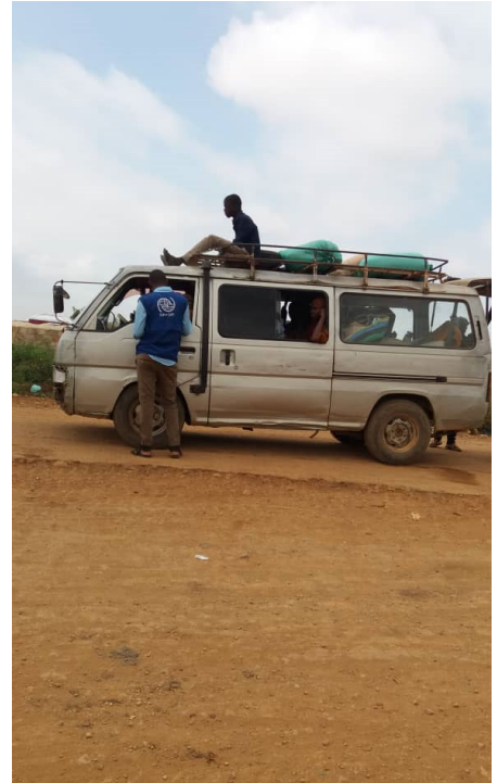
MTT enumerator interviews in Baidoa last week.