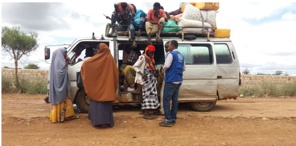
IOM MTT enumerators identifying IDPs Entering from IDP sites and conducting interviews with the heads of household.

MTT aims to complement existing information management products on displacements and movements in Baidoa, by providing site level specific data on population movements on a regular basis, to assist agencies operating in sites and settlements with key information on: demographics of movement, area of origin, area of return/onward movement, reasons for movement and movement trends over time.