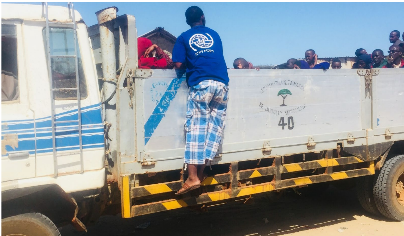
MTT Enumerator interviewing IDPs exiting in Kismayo Last week @ Keynan IOM Somalia 2018.

MTT aims to complement existing information management products on displacements and movements in Kismayo, by providing site level specific data on population movements on a regular basis, to assist agencies operating in sites and settlements with key information on: demographics of movement, area of origin, area of return/onward movement, reasons for movement and movement trends over time.