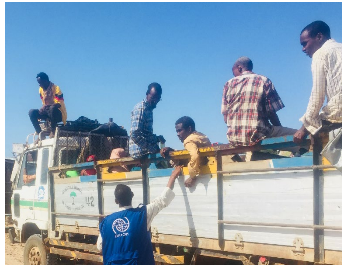
MTT Enumerator interviewing IDPs entering in Kismayo Last week