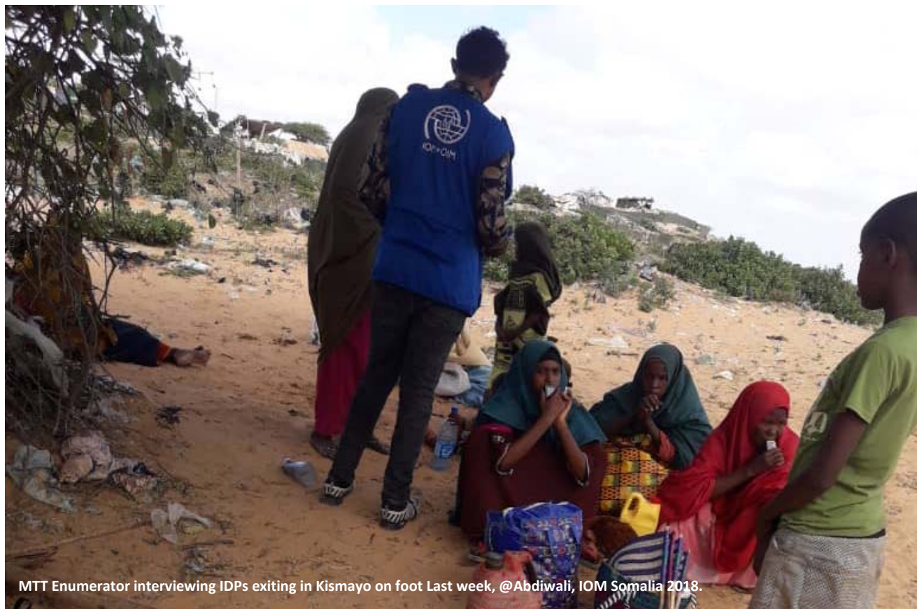
MTT Enumerator interviewing IDPs exiting in Kismayo on foot Last week, @Abdiwali, IOM Somalia 2018.

MTT aims to complement existing information management products on displacements and movements in Kismayo, by providing site level specific data on population movements on a regular basis, to assist agencies operating in sites and settlements with key information on: demographics of movement, area of origin, area of return/onward movement, reasons for movement and movement trends over time.