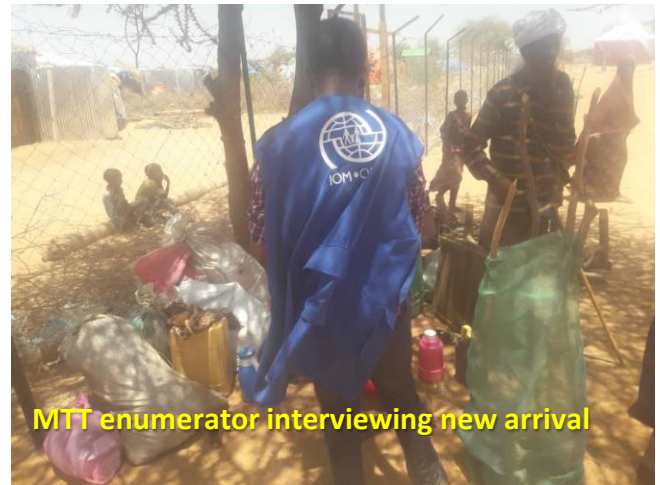
MTT enumerator interviewing new arrival