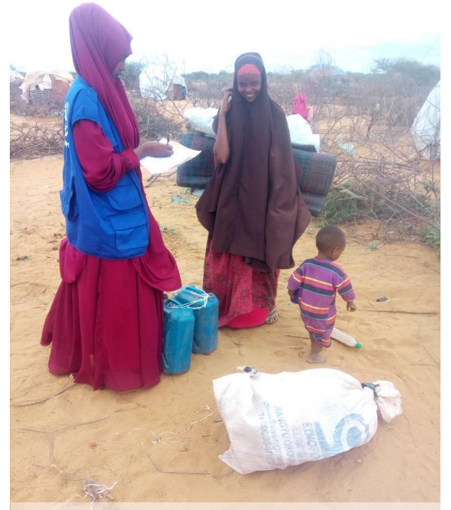
MTT enumerator interviews IDPs arriving in Dolow last week.