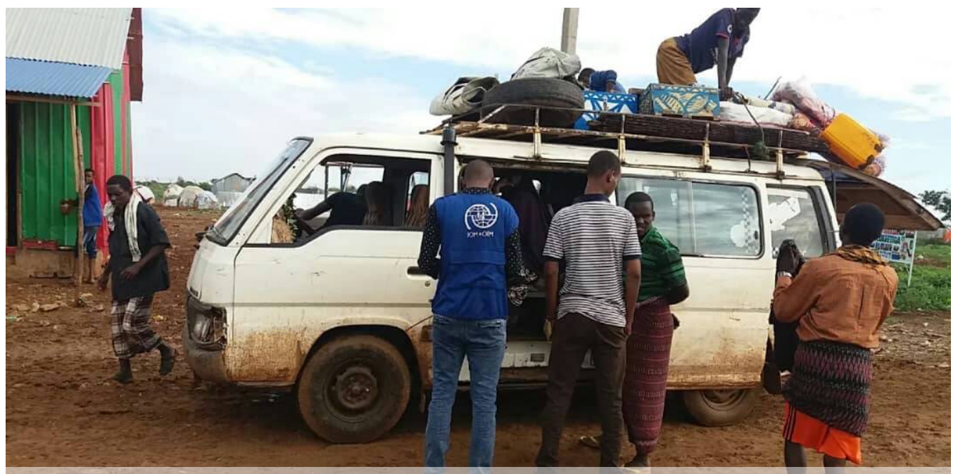
IOM MTT enumerators identifying IDPs exiting from IDP sites and conducting interviews with the heads of households.