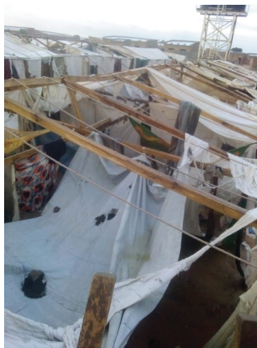
Above are Pictures taken at the site showing damaged shelters.