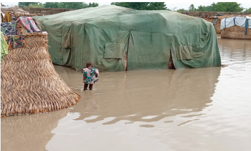
Above is a Picture taken at the site showing the flooded areas.

Response No assistance has been given on the date of publication.