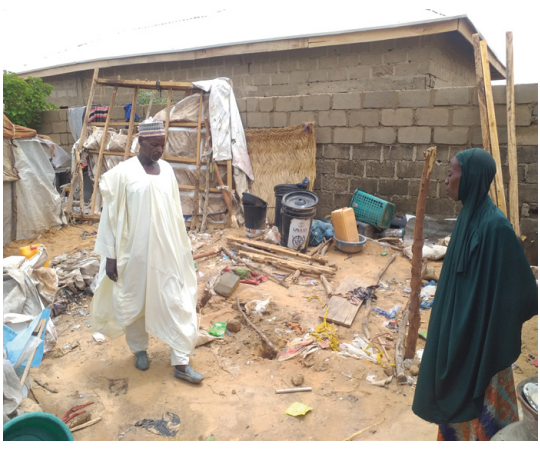
Most Needed Assistance. FIG 1.1