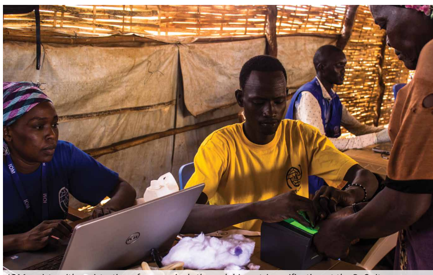
IOM assists with registration of new arrivals through biometric verification at the PoC site. IOM/McLaughlin 2017.

of the Wau town IDP population are children aged 4 years and below