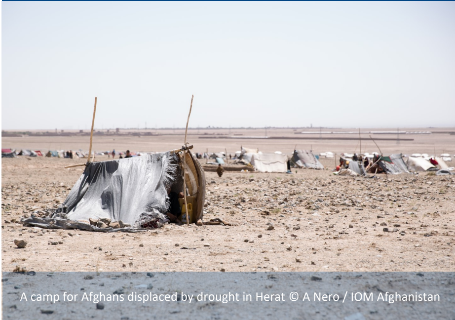
A camp for Afghans displaced by drought in Herat