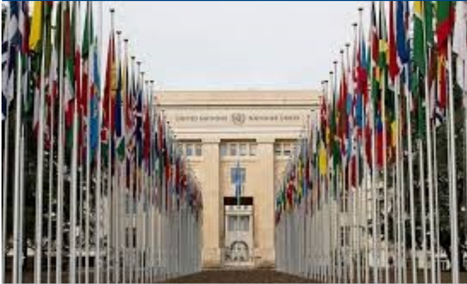
Palais des Nations, Geneva