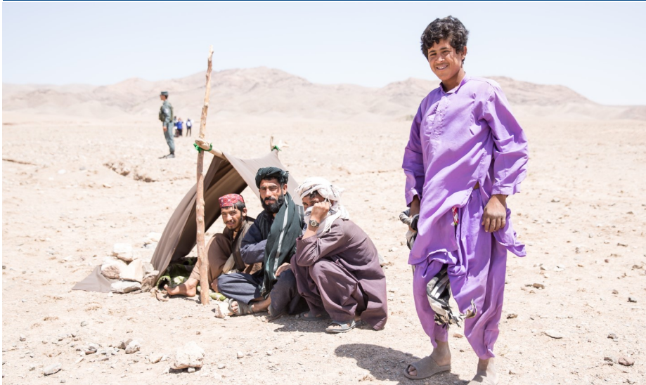
Afghan returnee families who were deported from Iran are receiving assistances in Nimroz Transit Center