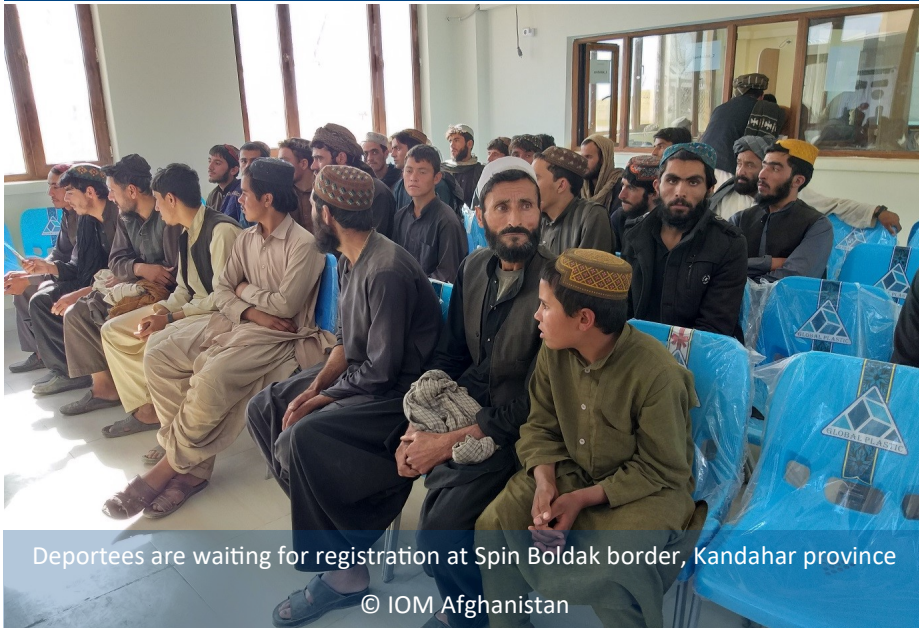
Deportees are waiting for registration at Spin Boldak border, Kandahar province