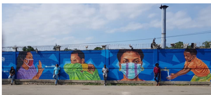
Mural painted by Haitian artist Assaf, in collaboration with IOM, at border post displaying messaging to fight COVID-19 transmission.