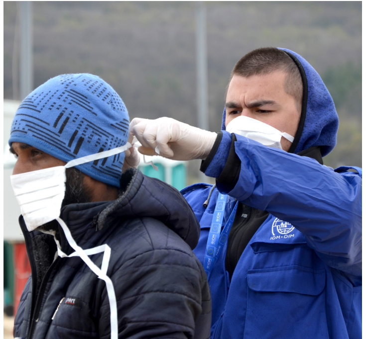
Hand disinfection and PPE distribution to migrants at Lipa Camp, Bosnia Herzegovina.

New funds: $92 M; Reprogrammed funds: $43 M.