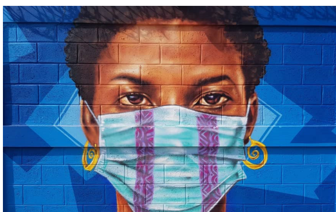
Mural painted by Haitian artist Assaf, in collaboration with IOM, at border post displaying messaging to fight COVID-19 transmission.